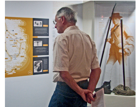
Above: Visitors to 'Les Trésors de l'Alpine Club' exhibition examining Whymper's ice axe, alpenstock and map of his travels.