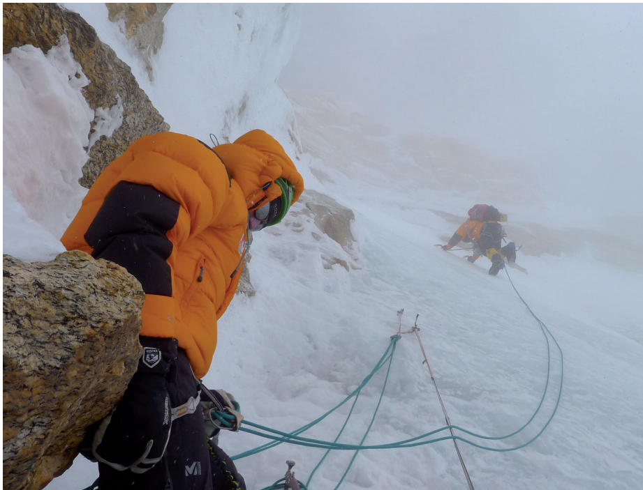
Late afternoon day 3, tackling a gully between rock bands. (GMHM Collection)