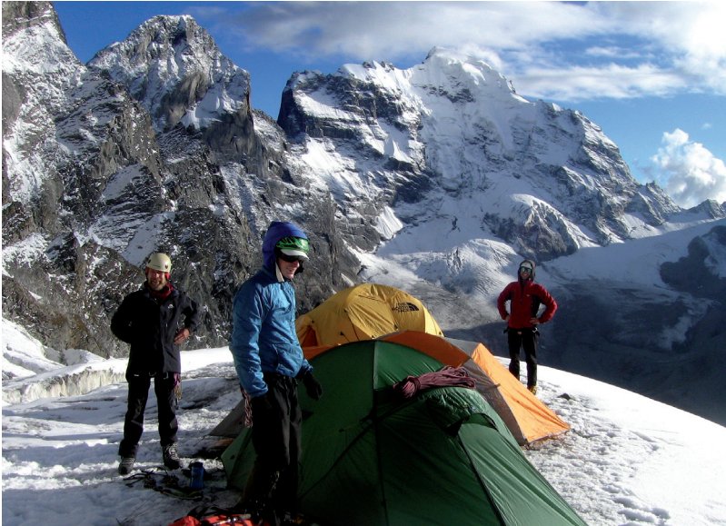
Camp II on the Danesh Parvat glacier, with Barmal in the background.