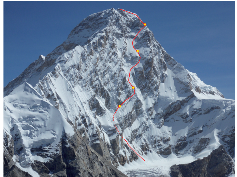
The GMHM group's route Spicy Game on Kamet's 2000m south-west face.

There exist mountains that we think are too high, too difficult, and too inaccessible. Kamet, for me, was just such a mountain, until I saw it for the first time. That was in 2009, during an expedition to Mukut Parbat 1 . The walk-in to Mukut Parbat caused us to pass right beneath Kamet's very impressive south-west face, 2000 metres of ice and granite. I still have a very fond memory of this first encounter.