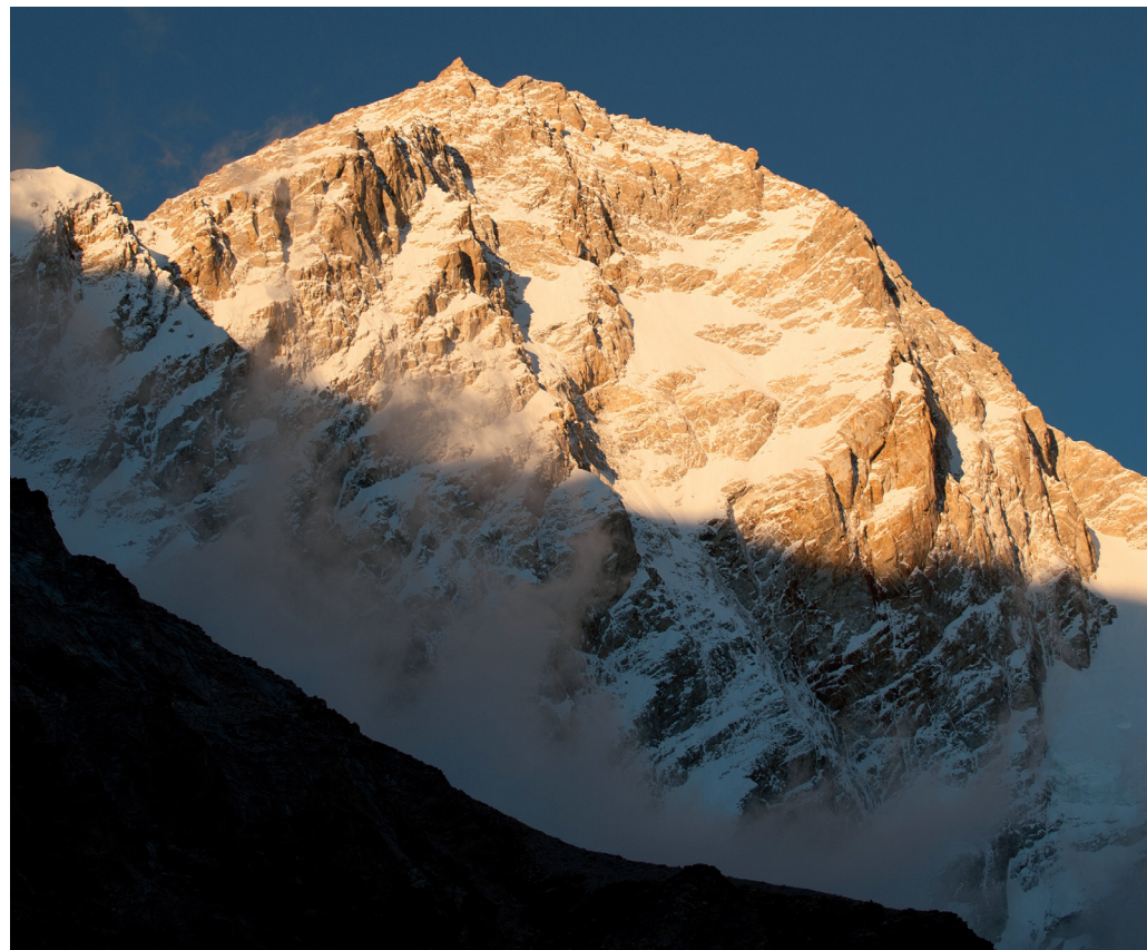
South-west face of Kamet (7756m), Central Garhwal.