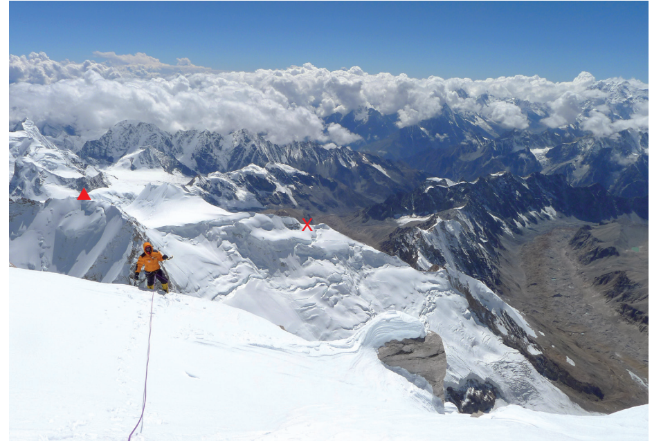
Approaching the summit of Kamet. In the background (▲) is Mana North-west where X marks the high point reached by the group on their acclimatisation attempt via the west ridge. (GMHM Collection)

North-west (7092m), climbing to 6500m by an easy but very aesthetic snow ridge (the west ridge) just above our basecamp. This also allows us a perfect view over Kamet's south-west face and also the line of our proposed descent down the unknown south face; up until this point we still had a few worries about getting back down from the summit.