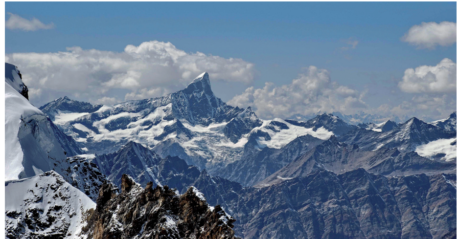
Shiva from the Miyar valley – 'something rather special'. (Andrey Muryshev)

'Frankly I cannot imagine how you will do it... It is c700m of climbing after the col and it is north-west side [sic] in October – all the rock will be frozen. From the other hand, the ice will be scarce as the buttress is very steep. So it will be very hard dry tooling and very hard protection. I saw your route on Siguniang – it is much easier.'