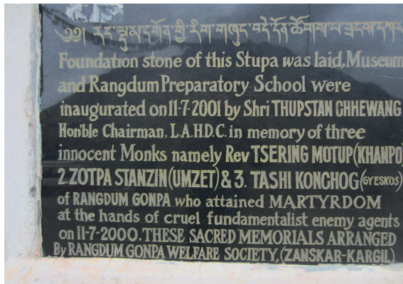
Memorial to three monks murdered in 2000, Ringdum Gompa. (Des Rubens)

The prospect was a pleasant one. We had a view of Pt. 6150 and could discern a possible route through a buttress on the skyline above the col between our mountain and G18. The next day the weather was poor, but a reconnaissance to a point above the col indicated feasibility. In line with a policy of moving slowly