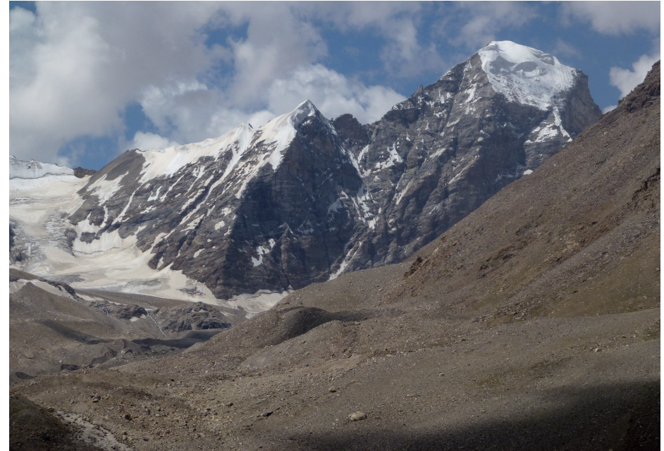
G22 (c. 6100m) with subsidiary Shan Ri on left.