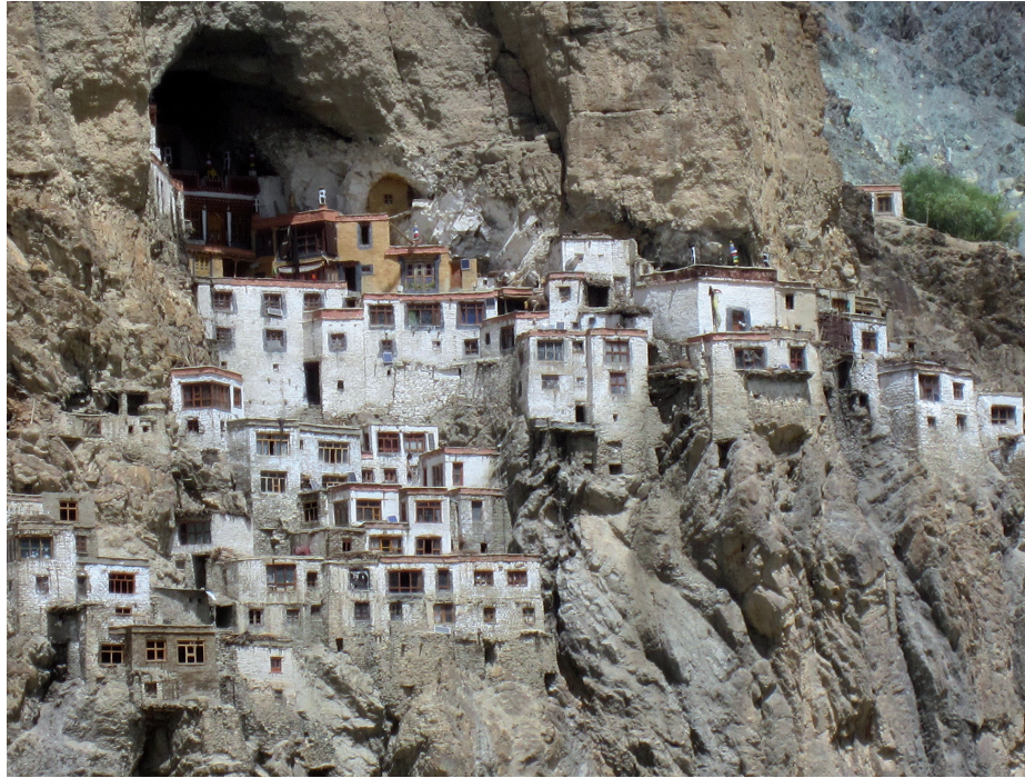
Phuktal monastery, Zanskar - 'a powerful sense of spiritual atmosphere'. (Des Rubens)