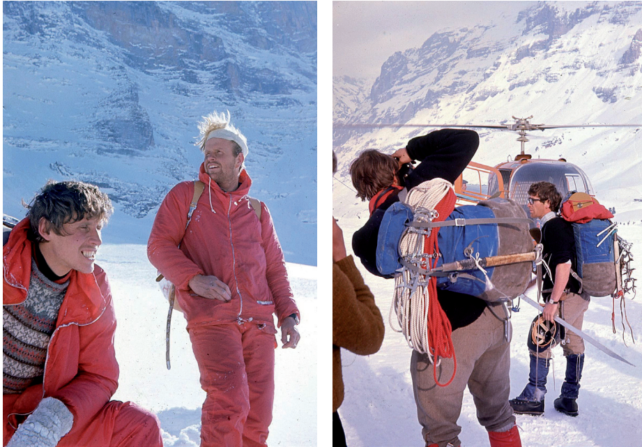
120. Eiger North Face 1966. Left: Douglass Haston and John Harlin II. Right: Neophyte photo-journalist Chris Bonington snaps Mick Burke.

that my one new winter route – Easy Gully , 180m II - was inscribed in the guidebooks.