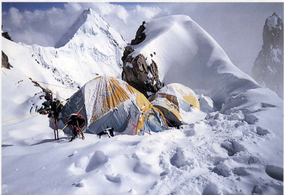
19. Camp 2, at 6600m, after a heavy snowfall. ( Jonathan Wakefield ) (p39)