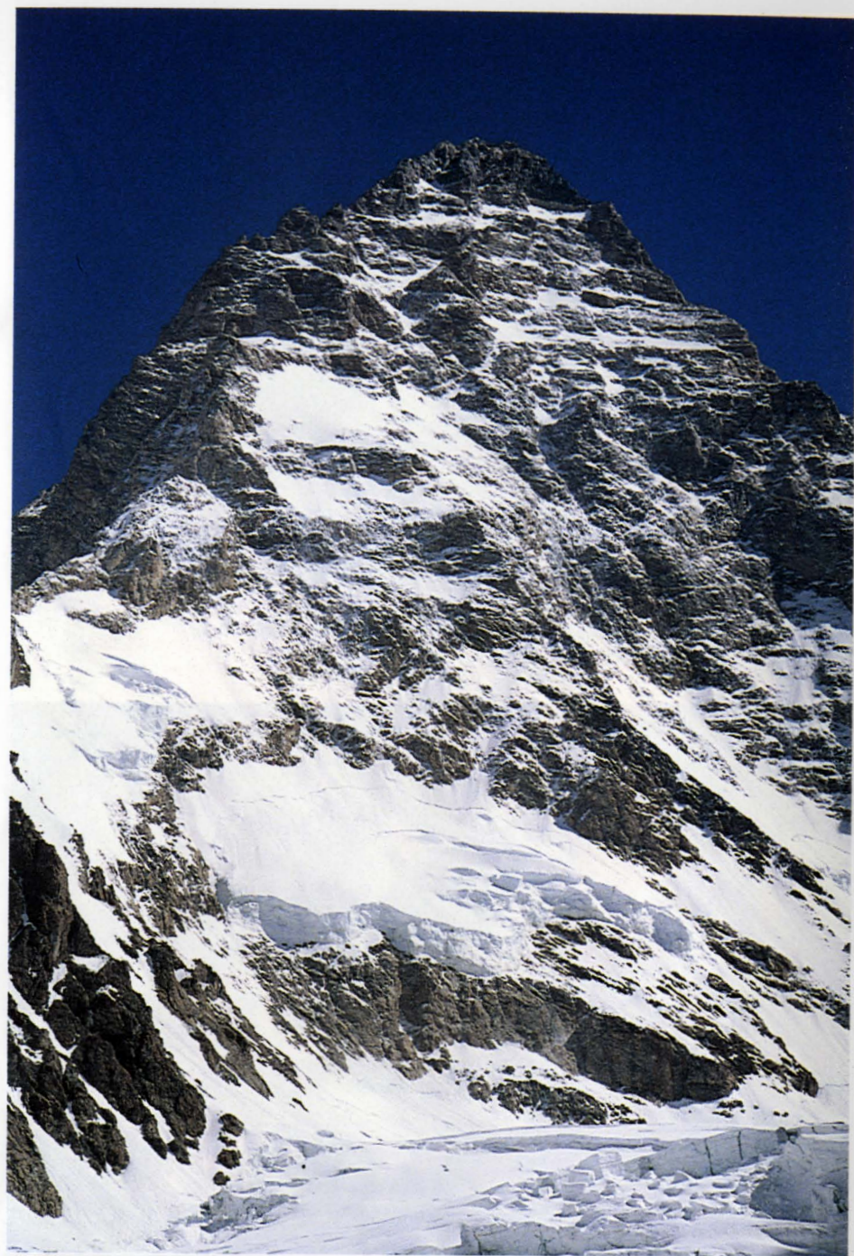
17. The 1993 K2 West Ridge Expedition. The West Face of K2. (Jonathan Wakefield) (p39)