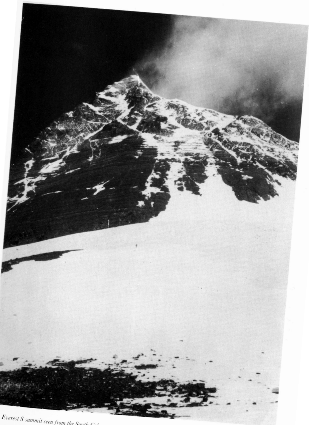
Everest S summit seen from the South Col