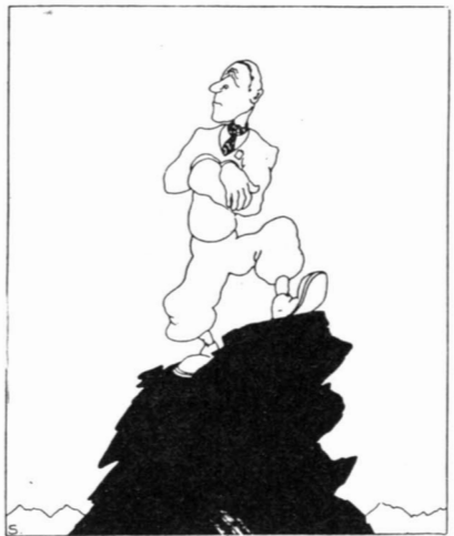
25 Specimens of Alpine fauna: (Top left) The north face climber. (Top right) The urban gorilla (alpinist patagon). (Bottom left) Lord Filaplomb. (Bottom right) The Alpine Clubman

In Choucas the stylized simplicity of the drawings matched by terse captions came from a keen yet detached observation of the 'follies and weaknesses of mankind' in the mountains. Sustained wit and humour of this kind argues a delicate balance on the narrow ridge between two slippery slopes. On the one hand a descent into acid denigration and on the other into mere facetiousness or slapstick comedy.