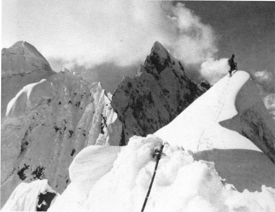
87 The summit of Milpocraju looking over to Cayesh