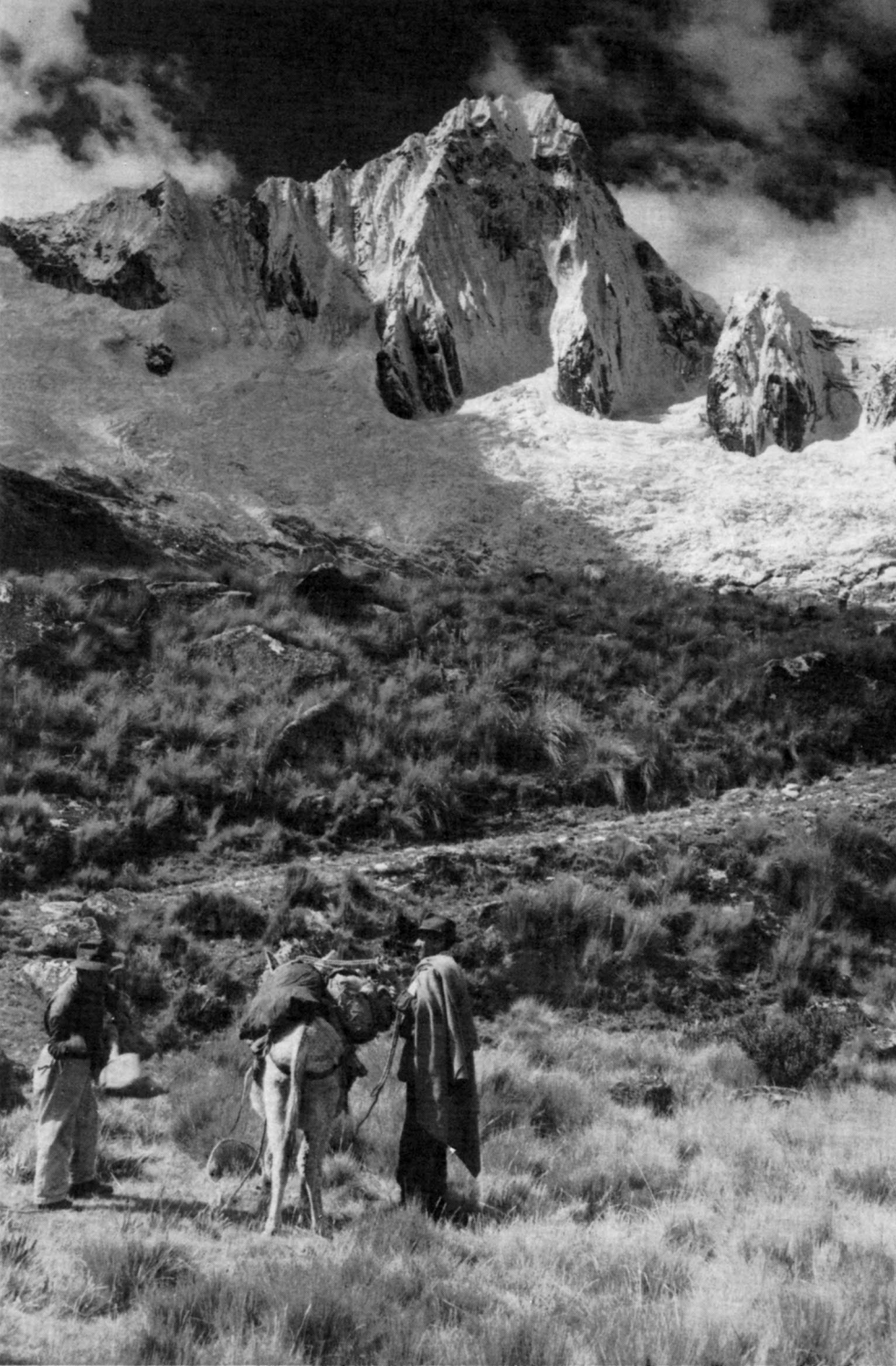
86 Taulliraju