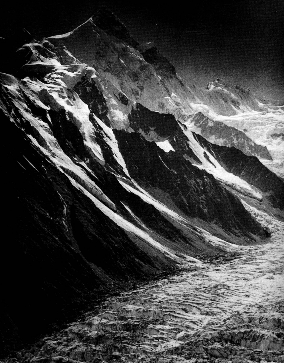
81 Shispare over the Pasu glacier.

Mr J. Kurczab, the leader, left the group and climbing alone, reached at 16.30 the unnamed peak of 7090 m. Whereafter the peak was named Ghenta Peak (in Urdu language and in the local language of Hunza valley the word 'ghenta' means 'bell'). The other 7 reached Shispare summit (7619 m) at 18.30. From the snowy plateau the route led up a 45^{\circ} slope. The snow conditions were good, only the last metres to the peak had to be protected with rope. The group