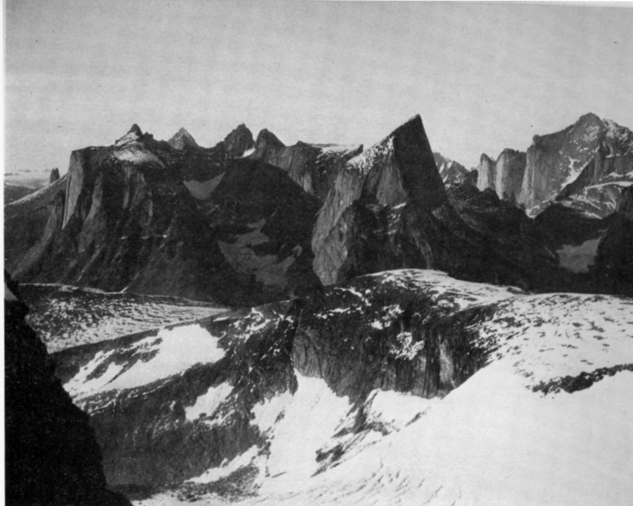
96 Peaks in the Cap Farvel area.

glacier. An attempt to penetrate the range by way of a steep and narrow ice-fall at the glacier head was foiled by the unstable nature of the fall and the danger of stone-fall and avalanche. An alternative route was found by way of the Christian IV glacier system, the Korridoran and Ginos glaciers. On 6 August the whole party made the second ascent of Gunnbjorns Fjeld (approx. 3700 m). The route followed the steep, knife-edged snow of the North-west ridge (for first ascent of the mountain by the South ridge in 1935 see A.J. 48 54). The party reversed the outward route back to the coast.