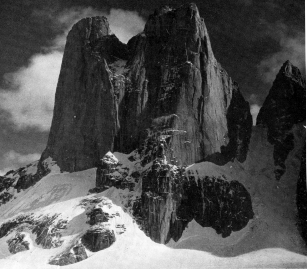
98 Mount Asgard .

Evighedsfjord region, West coast (lat 66°N) An Army M.C. expedition made eleven first ascents from a Base Camp on the north shore of Kanguissaq. An attempt on the highest peak of the area, Pt 2050 m, was abandoned due to snow conditions.