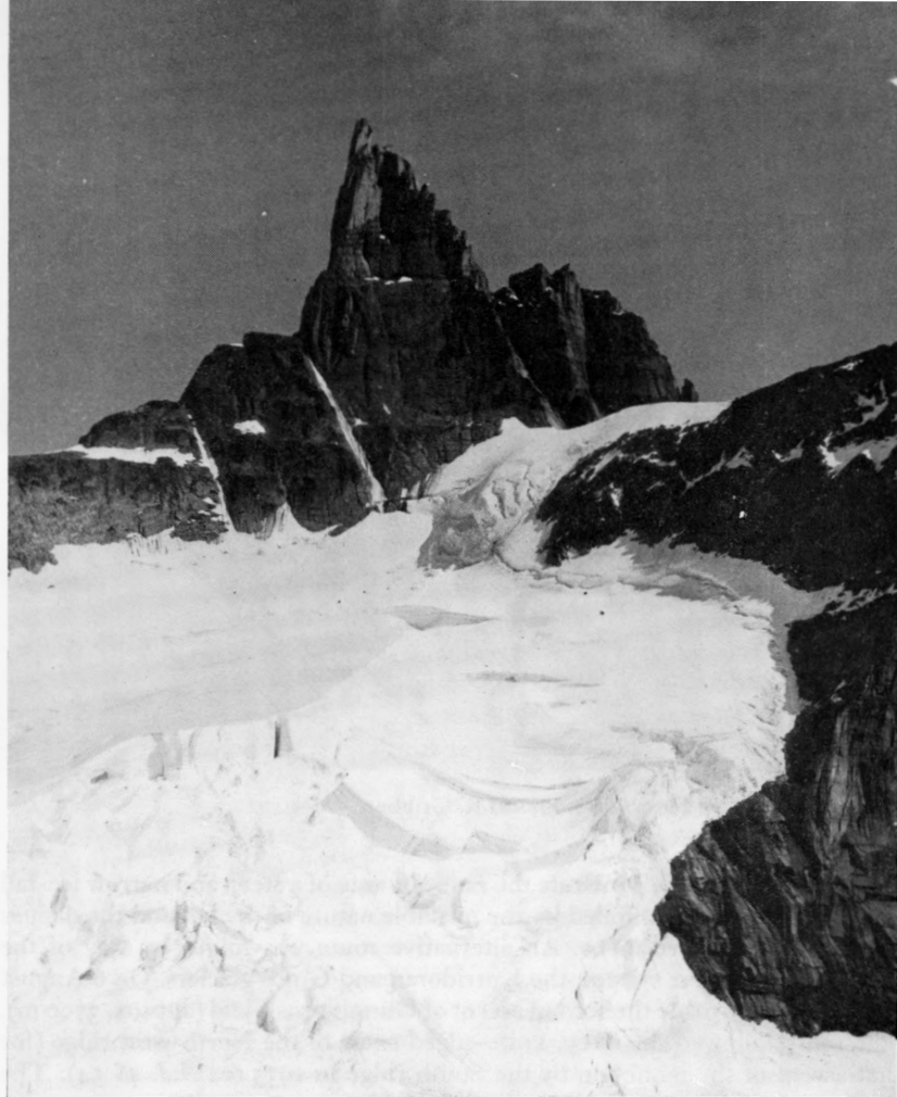
97 The Minster.