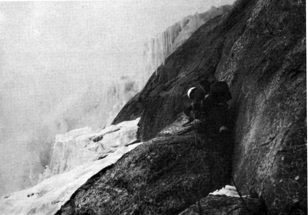
13 Also avoiding the bergschrund, in cloud