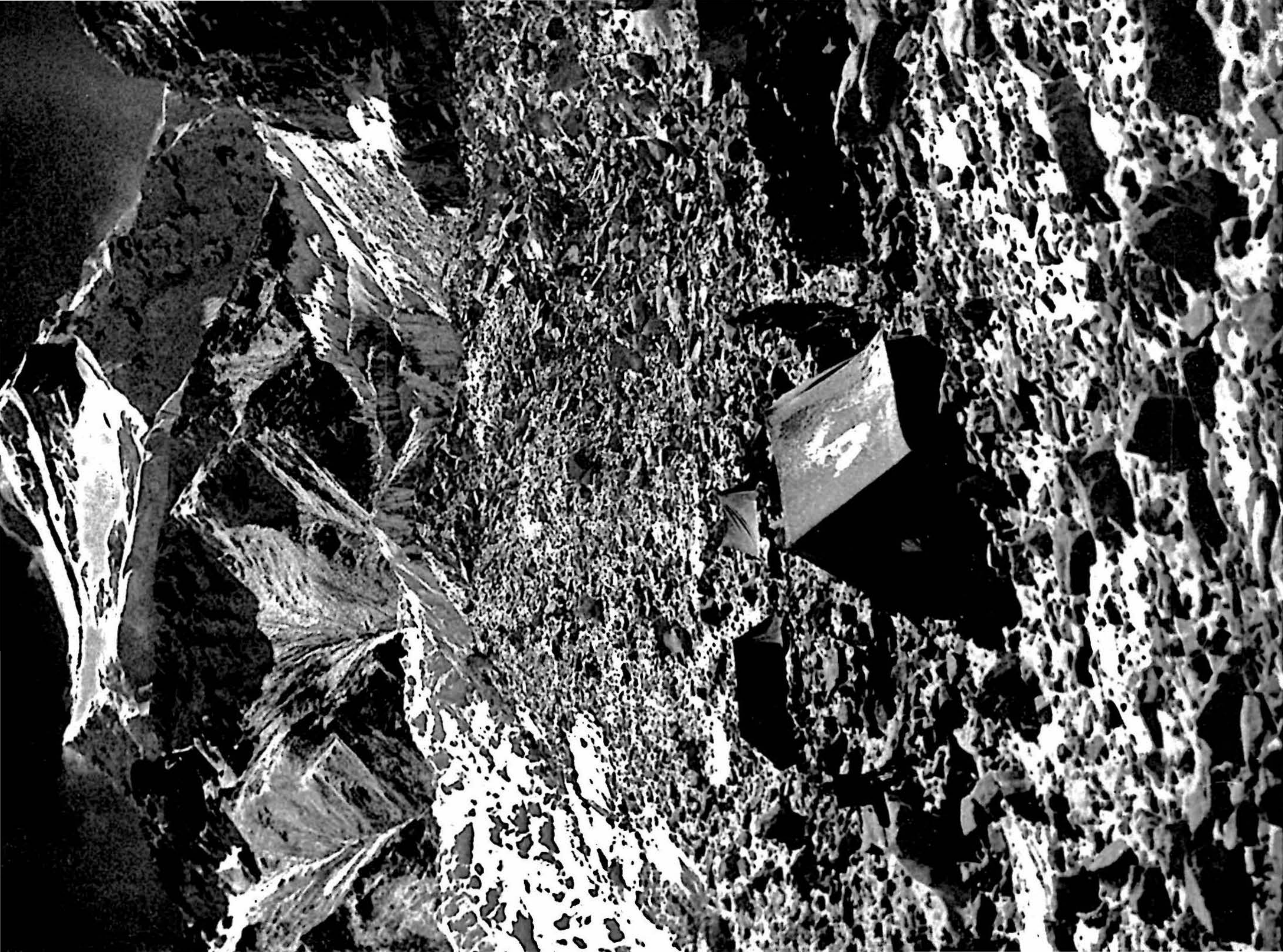
CHO OYU FROM BASE CAMP.