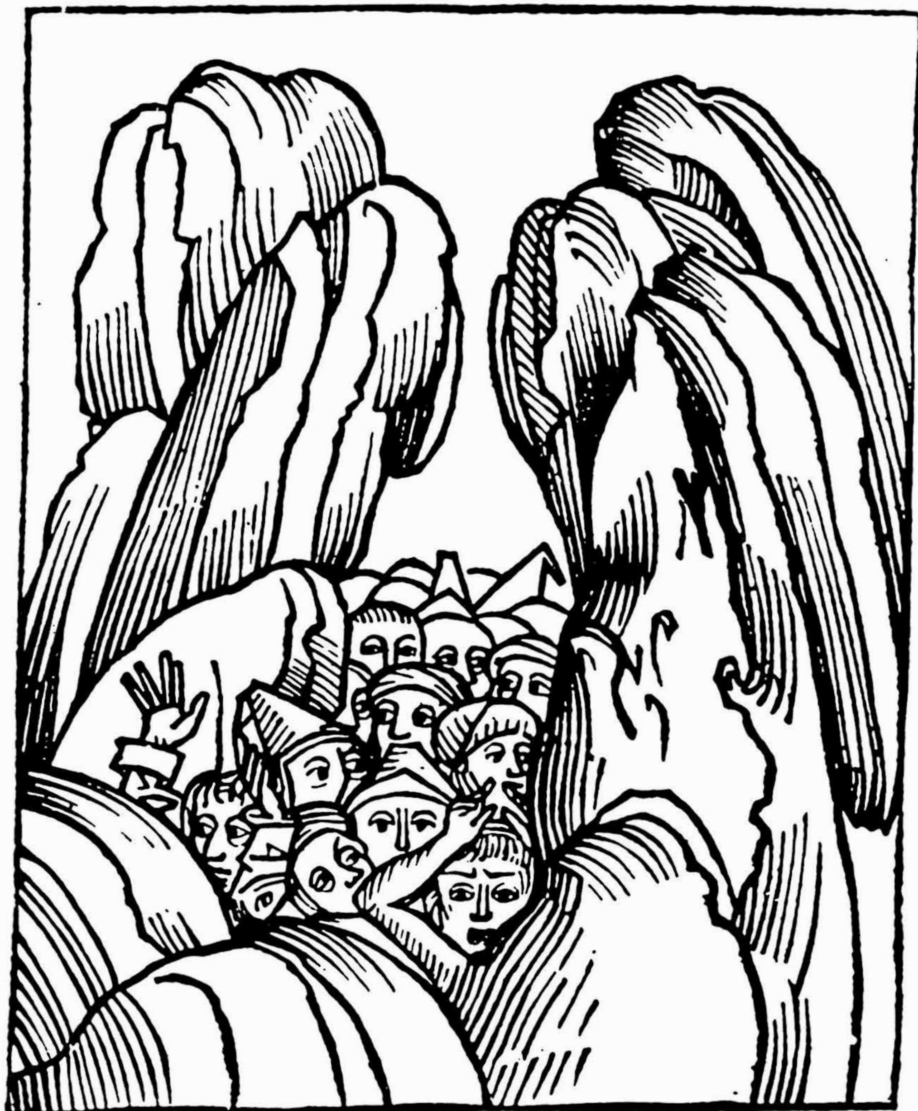
Éboulement du mont Granier en 1248. Bois de la Chronique de Nuremberg (1493).

THE LANDSLIP OF MT. GRANIER ( Nuremberg Chronicle 1493).