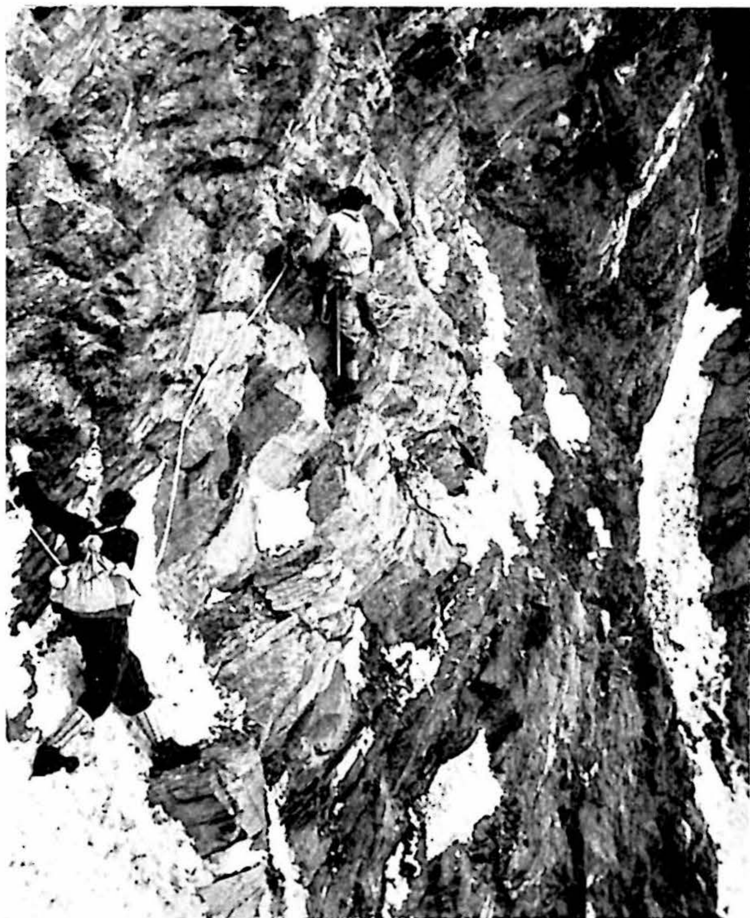
TASCHHORN, S. FACE. TRAVERSE OF GREAT COULOIR, 1943 ROUTE.