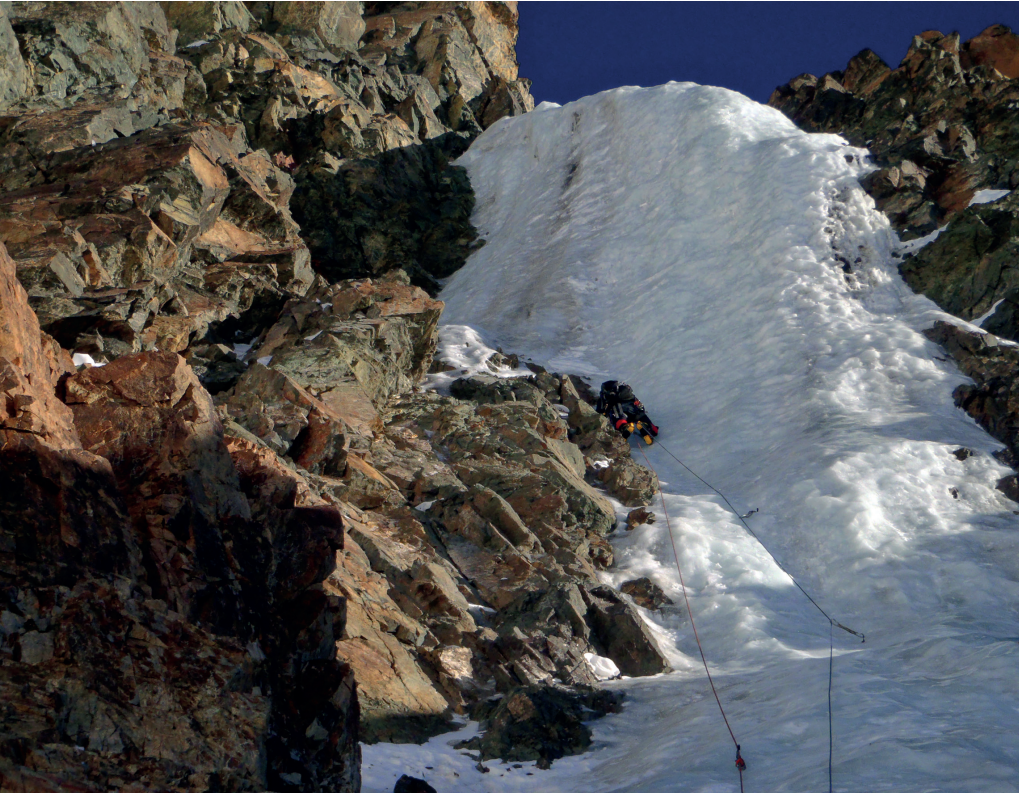
Chicho Francia nearing the top of the first pitch on the east face of Vallecitos. ( Matías Hidalgo Nicosia )