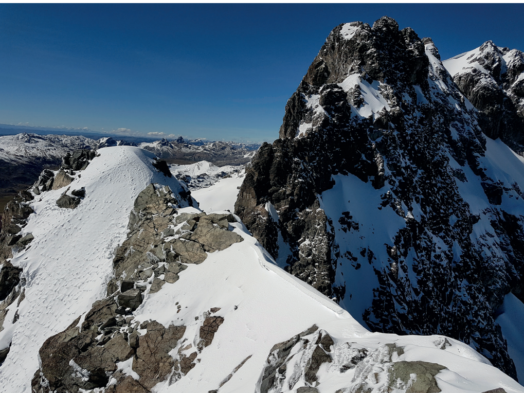
View from the north peak towards the summit of Rajuntay.