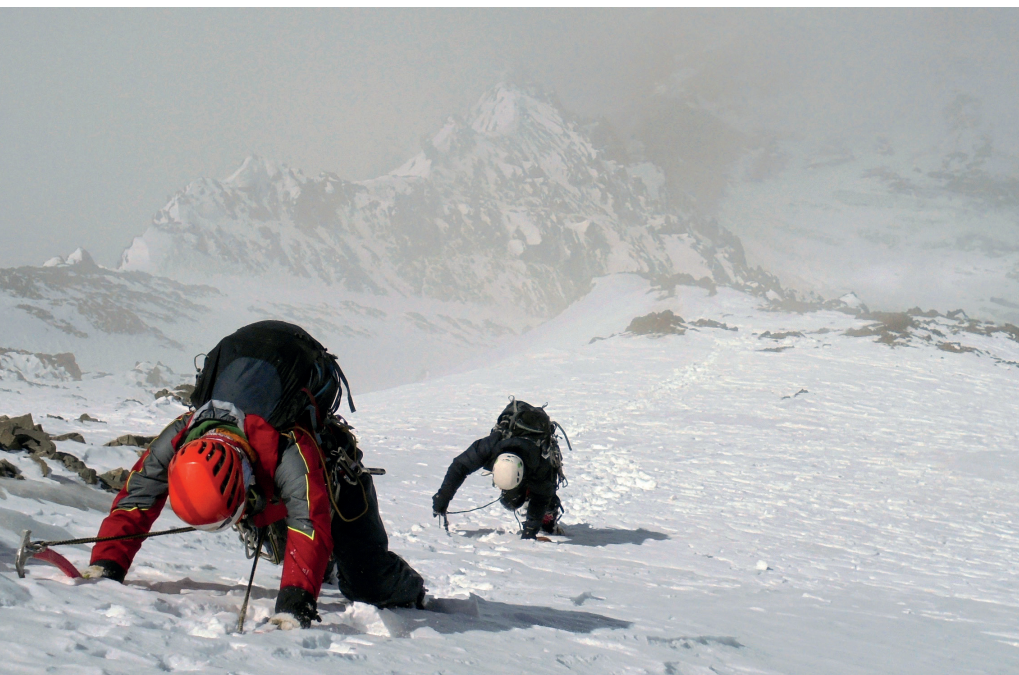
Matías Sindoni and Chicho Fracchia just below before the summit ridge on the south face of Vallecitos. ( Matías Hidalgo )