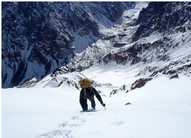
Climbing the east face on the first ascent of Copla Blanca (4630m) in the Río Tupungato. Although straightforward at PD, the mountains are remote.