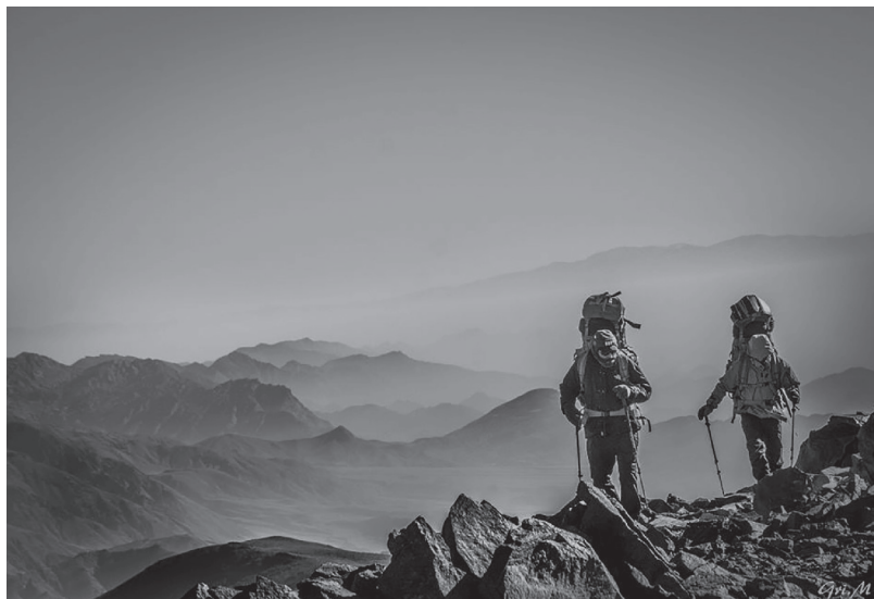
On the lower slopes of Cerro Overo on the epic traverse of the Famatina Range.

Once again, Argentina experienced a high devaluation of its currency, in the order of a hundred per cent, so it's become much cheaper for foreigners. There are also new low-cost flights and better access to the mountains, most of them awaiting a first ascent or a new route. Unusually, many of these flights do not require travellers to go through the capital Buenos Aires. These direct routes between Argentine cities are consequently less expensive and quicker. The weather has been good and on Aconcagua, Argentina's most visited mountain, there was a very good season with no deaths: this was the first season with no fatalities for 29 years. All ascents are from the 2018 season except where stated.