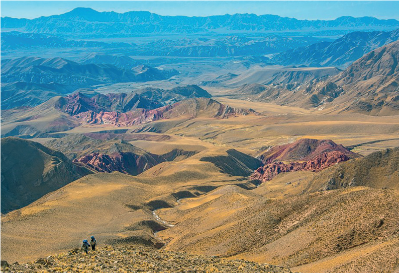
On the Cuesta del Tocino on the first part of the Famatina traverse.