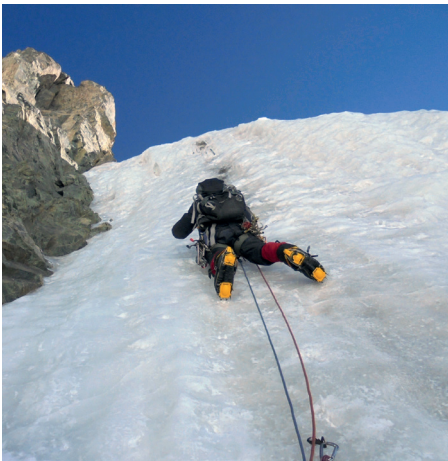
Chicho leading the start of the steep second pitch. ( Chicho Fracchia )